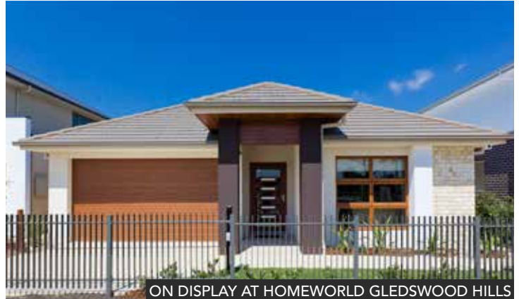
ON DISPLAY AT HOMEWORLD GLEDSDOOD HILLS